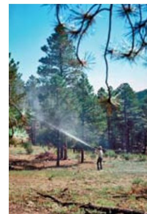
Figure 10: Large, uninfested pine being preventively sprayed. This protects high-value trees and should be done annually between April 1 and July 1.