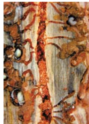
Figure 8: Characteristic tunnels (galleries) of mountain pine beetle made by the adults and larvae. The underbark area looks like this in late spring. Bluestained wood is caused by fungi the beetles introduce.

An important method of prevention involves forest management. In general, MPB prefers forests that are old and dense. Managing the forest by