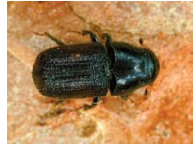
Figure 3: Top view of adult MPB (actual size, 1/8 to 1/3 inch).

Mountain pine beetle has a one-year life cycle in Colorado. In late summer, adults leave the dead, yellow- to red-needled trees in which they developed. In general, females seek out large diameter, living, green trees that they attack by tunneling under the bark. However, under epidemic or outbreak conditions, small diameter trees may also be infested. Coordinated mass attacks by many beetles are common. If successful, each beetle pair mates, forms a vertical tunnel (egg gallery) under the bark and produces about 75 eggs. Following egg hatch, larvae (grubs) tunnel away from the egg gallery, producing a characteristic feeding pattern.