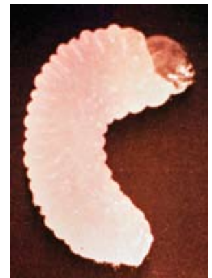
Figure 5: Larva of MPB (actual size, 1/8 to 1/4 inch). They are found under the bark in tunnels.