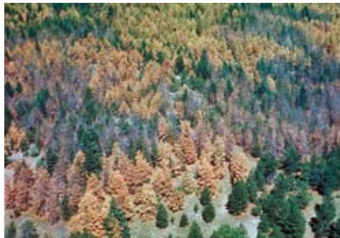
Figure 4: Mountain area infested by MPB, showing three years of mortality. Old, dead trees are gray; newly killed trees are straw yellow or orange. Some trees may also be infested but do not turn color until nine months or so under attack.

MPB larvae spend the winter under the bark. Larvae are able to survive the winter by metabolizing an alcohol called glycerol that acts as an antifreeze. They continue to feed in the spring and transform into pupae in June and July. Emergence of new adults can begin in mid-June and continue through September. However, the great majority of beetles exit trees